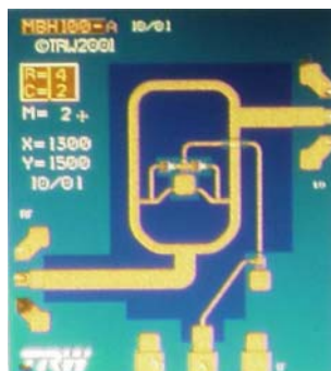
X=1300 μm Y=1500 μm